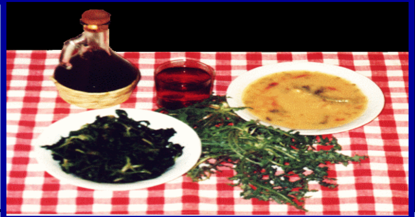
Cicorie and favetta