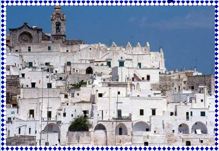
Ostuni the white city