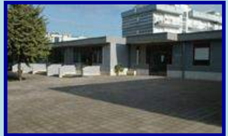
BARTOLO DI TERLIZZI