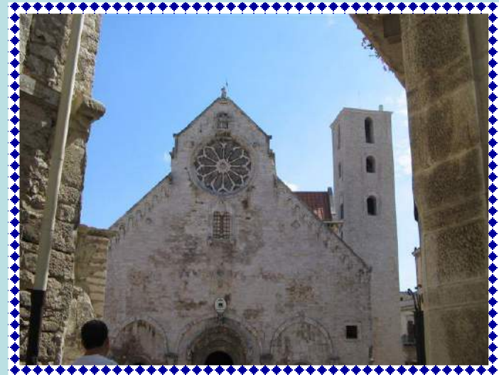
Ruvo di Puglia