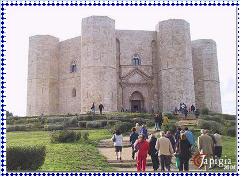
Castel del monte