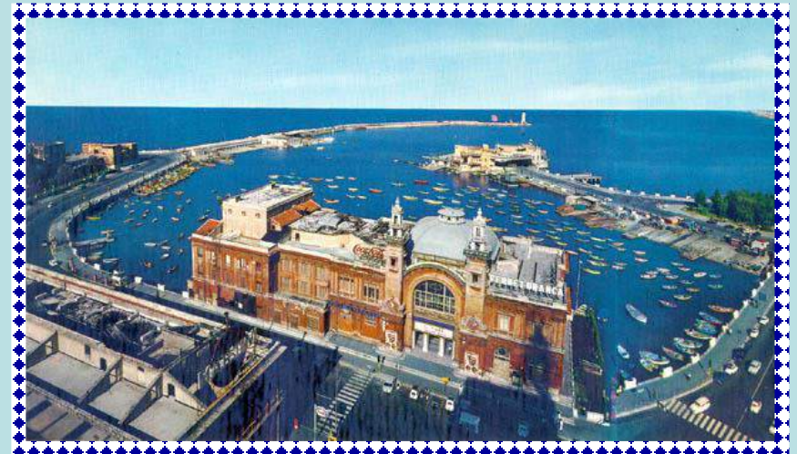
BARI, the capital city