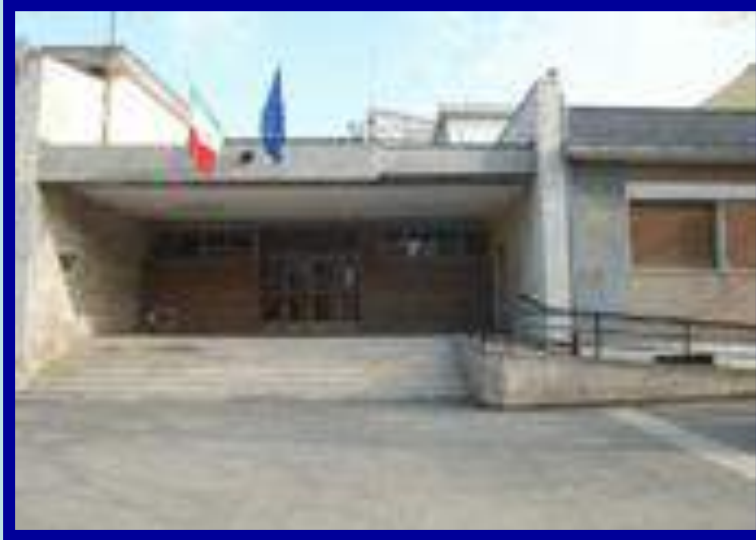
SAN GIOVANNI BOSCO